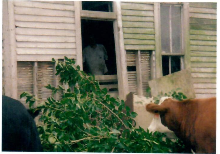
The house's former occupant!