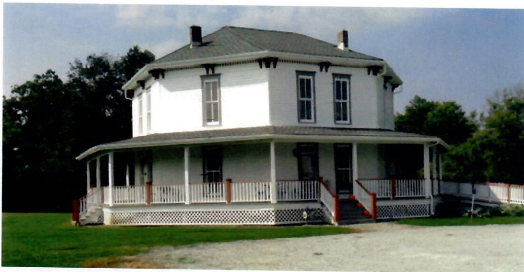
What it looks like today!