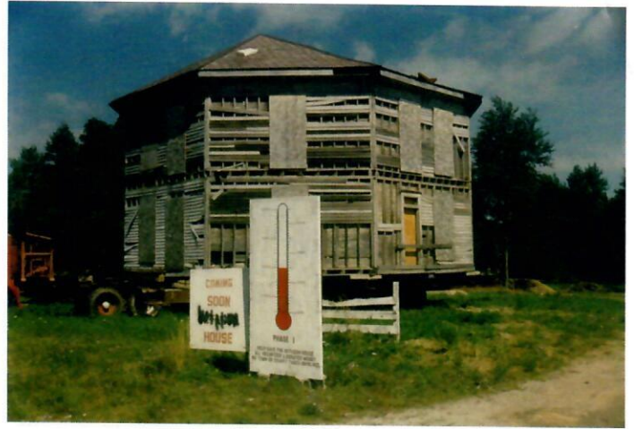
The Octagon House's Beginning 1997