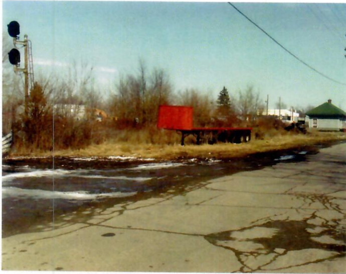
Lot where the house now resides prior to cleaning it up.