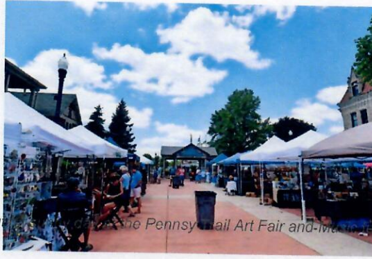
Pictured: Crowds gather and enjoy a beautiful day at the 2019 Pennsylvania Art Fair and Music Festival held on July 29th.

Click here to purchase photos from this gallery